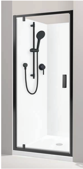
Note: Tapware and accessories illustrated in photography are not included

The Valencia Elite Alcove Pivot Shower combines exceptional performance with ease of installation. Beautifully engineered, this black frame shower is available in a range of sizes and wall options. The enclosure features a fully reversible door with 6mm toughened safety glass. The Quick-Fit low profile tray features an ultra high 40mm upstand for maximum watertightness, ensuring long lasting performance.