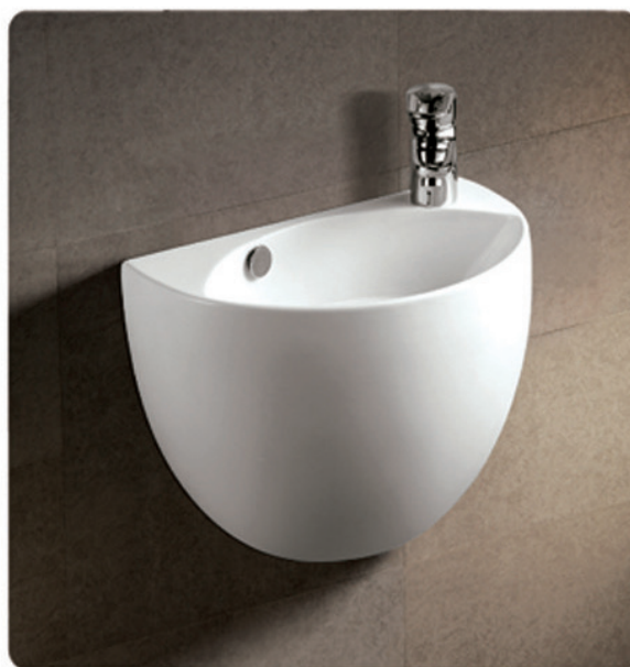
All measurements shown are in millimetres Size are approximate